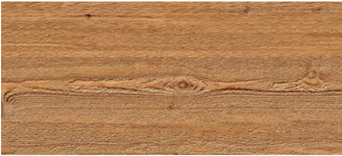
ROUGH SAWN NATURAL CEDAR